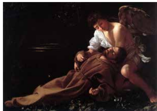
Caravaggio, Embracing Sister Death