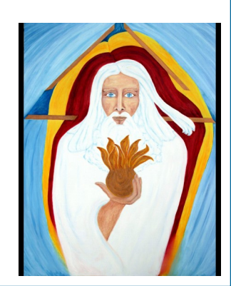
Image of the Sacred Heart of God the Father