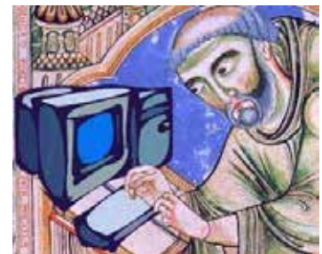
"Monk at Computer" from the Centre for the History of the Book, University of Edinburgh