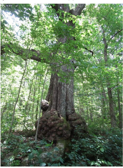
Appalachian Trail, Shenandoah National Park

I highly recommend spending some time in nature as a way to restore one's soul. It can bring so much joy and inner peace. Maybe it is just a few moments sitting on a bench at a local park. Maybe it is a few moments just gazing into the backyard. Take time to appreciate the God beauty that surrounds us.