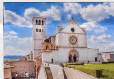
Basilica of St. Clare