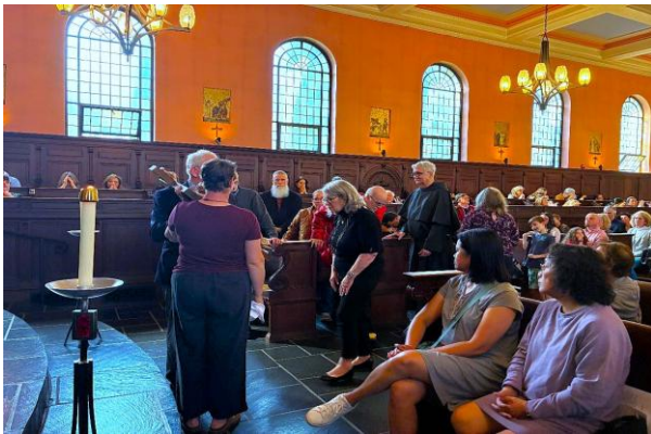
Veneration of the Cross Friday, April 3