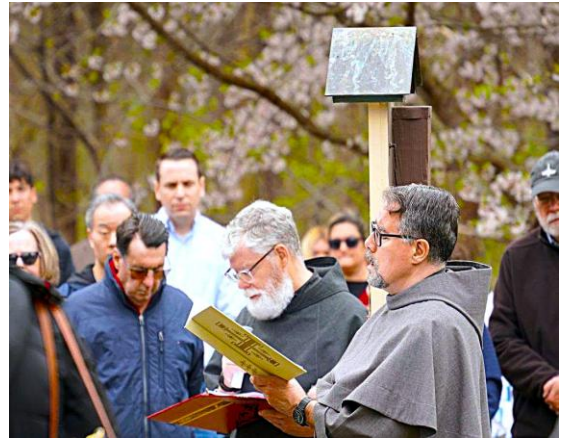
Outdoor Stations of the Cross Friday, April 3