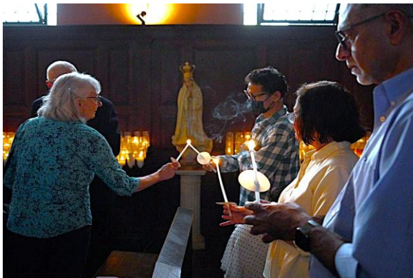
Easter Vigil Saturday, April 4