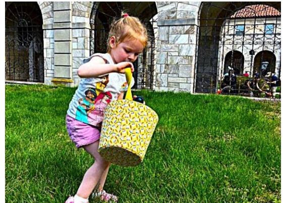
Easter Egg Hunt Saturday, April 4