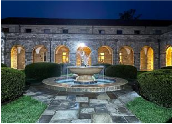
Holy Thursday Thursday, April 2

Thank you to all who joined us for the Triduum and Easter!