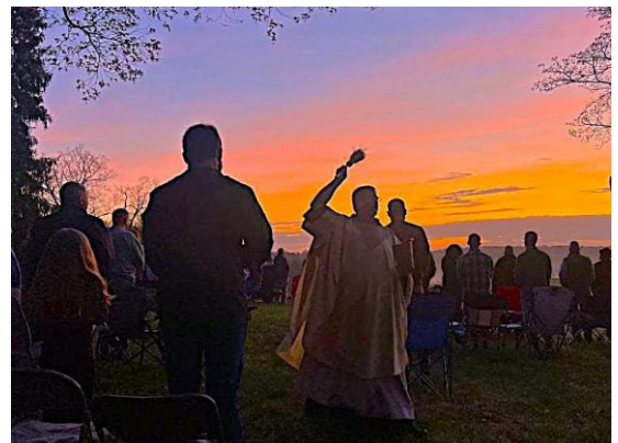
Sunrise Mass, Easter Morning Sunday, April 5